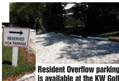
Resident Overflow parking is available at the KW Golf Club parking lot where we maintain 12 spaces for your use.

Visitor Parking is only available in the two lots at the Community Center. Thank you.